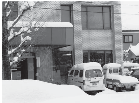
Photo 1: Front view of the base of the Support Group from KOBE (Date taken: February 22, 2005)

A few weeks after the quake, the NVNAD and another nonprofit organization formed a consortium for the disaster relief known as the "Support Group from KOBE." 8 The group rented a room in an office building (Photos 1 and 2) and opened an operating