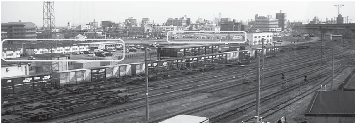
Photo 3: Side view of the southern part of the area shown in Figure 1 (Date taken: May 6, 2006; Shooting angle: south to north; Photographer: Koichi Suwa) The temporary houses are located in the circled areas.

On November 29, the authors and the students who had visited the affected area held a briefing session for the other students. It was at the end of this meeting that the first author called on the participants at the session to launch the mailing list named "fromHUS," whose members included faculty and