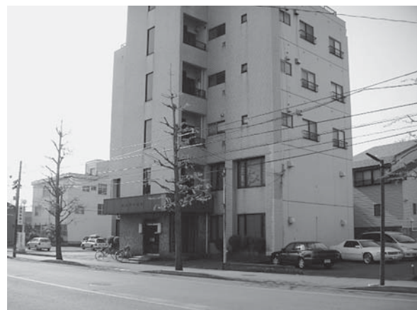
Photo 2: Exterior of the building in which the Support Group from KOBE was located (Date taken: May 6, 2006)