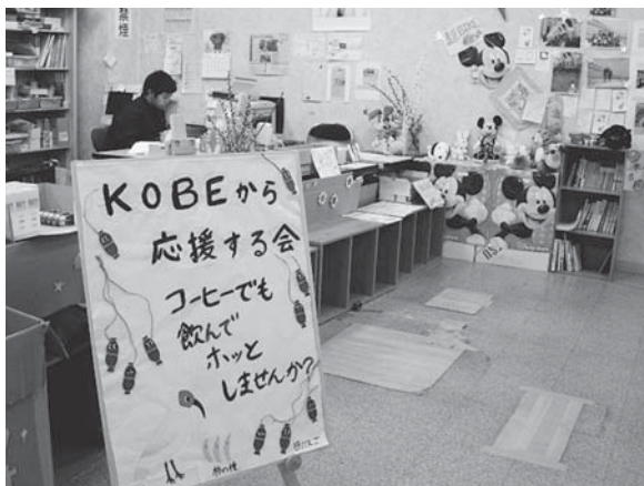
Photo 4: Interior view of the base of the Support Group from KOBE (Date taken: February 23, 2005)

In the last few weeks of December 2004, they organized space in the operating base for the residents, especially for the elderly and those living alone. The aim was to provide comfort and relief and to alleviate the residents' tension and anxiety. They opened a coffee corner in the operating base of the Support Group from KOBE where they not only provided coffee but also engaged in various activities to manage the space